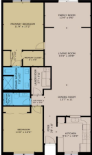
Beautifully Updated 2 BR 2 FB End-Unit Villa Bonus Family Room, Inside Laundry Room & Garage Highland Lakes Membership Privileges Convey

Welcome home to this stunning property located in Villas on the Green, nestled in Palm Harbor’s premier 55+ golf community of Highland Lakes. This spacious 2 bed, 2 bath, 1 car garage villa boasts an updated interior with a desirable split and open floor plan. Enjoy the privacy of being an end unit with no [...]