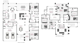
4625 W LAMB 2 Bedroom 6 Bath