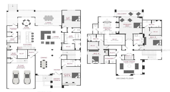
4625 W LAMB 5 Bedroom 6 Bath