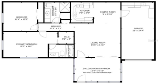
Beautifully Updated 2 BR/2B Villa Newer Electric Panel, HVAC & Impact Windows Attached Garage & Highland Lakes Privileges Convey