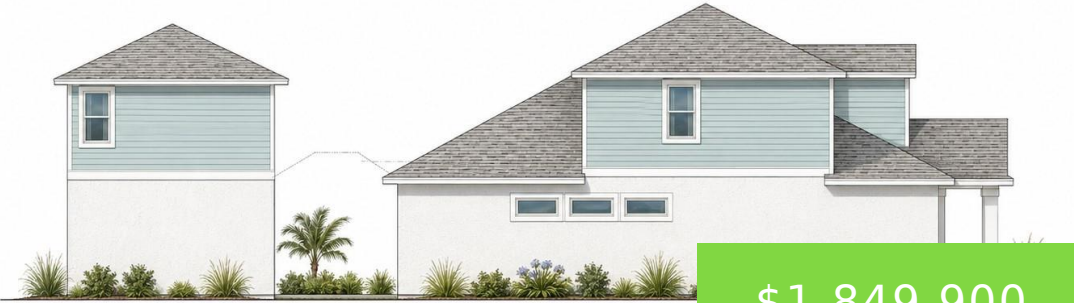
LEFT SIDE ELEVATION ( SOUTH )