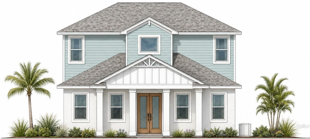
FRONT ELEVATION ( EAST )